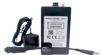
AirSync Bridge unit and SD card